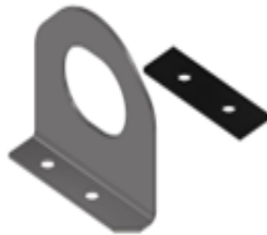
212115 - Stiffening Ring Bracket

Location of roof stiffening rings have been predetermined and clearly identified within the installation instructions. The roof ring brackets have been designed with ease of installation and safety in mind. By applying the neoprene gasket prior to the bracket allows for a tight seal which avoids any roof leakage.